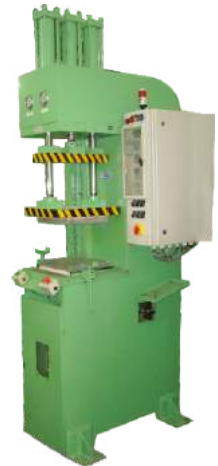
HYDRAULIC RUBBER INJECTION MOULDING MACHINE