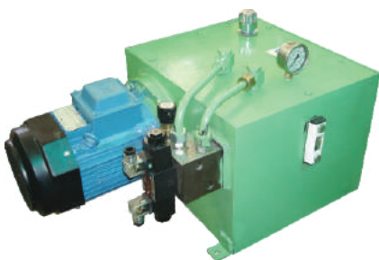
MINI HYDRAULIC POWER PACK