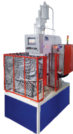
HYDRAULIC PRESS WITH INDEXING TABLE