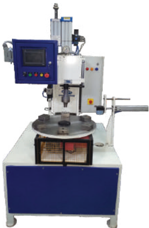
HYDRO-PNEUMATIC PRESS WITH INDEXING TABLE