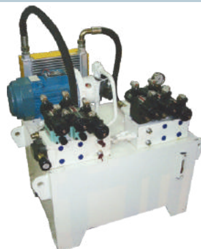
HYDRAULIC POWER PACK FOR SPM