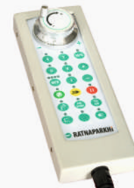
Pendant unit with MPG & multiple controls.